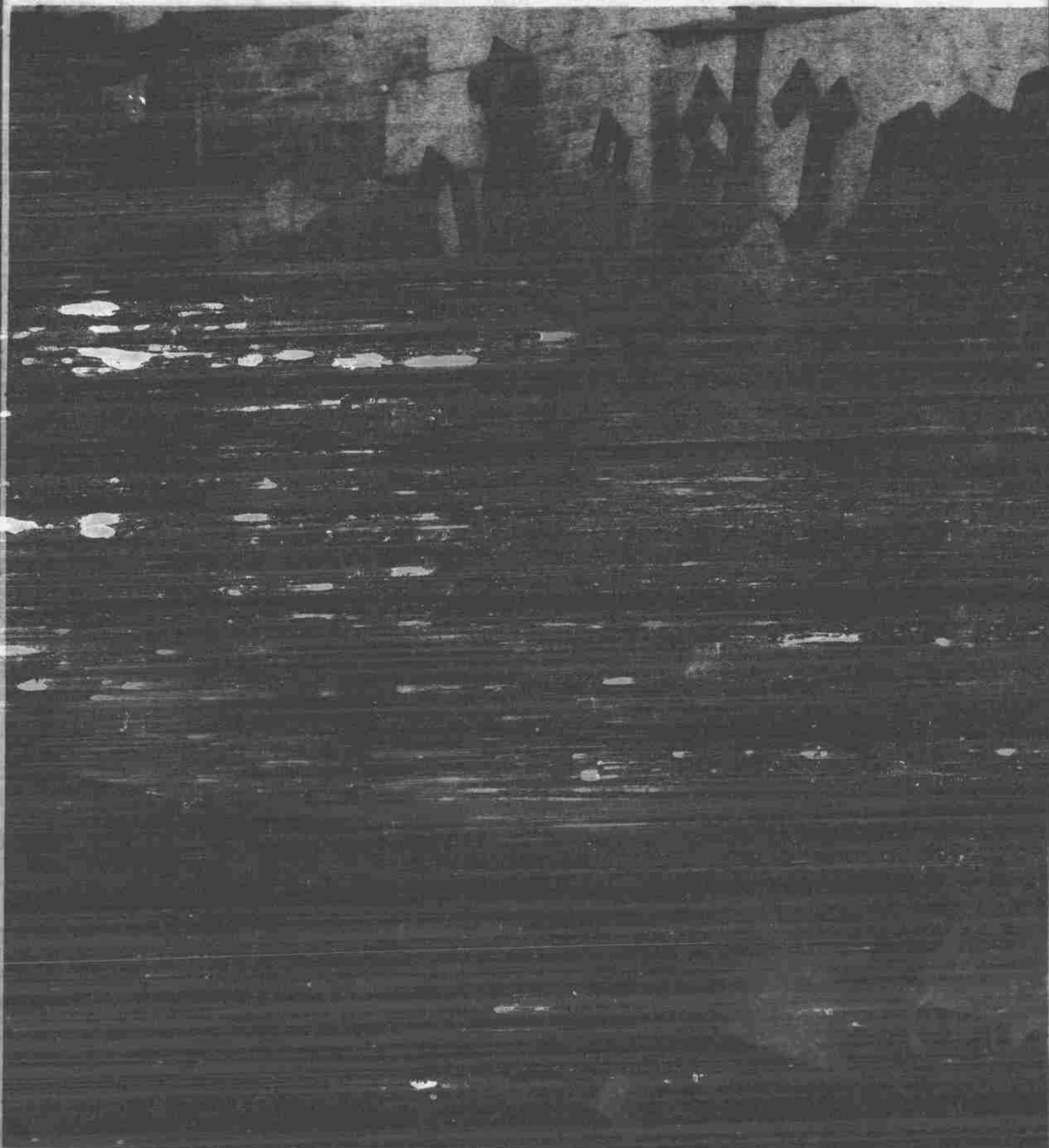
An English businessman believed to have a terminal illness ponders his fate in "Last Holiday." The drama is one of several Guinness films featured on the Nebraska ETV Network this summer.