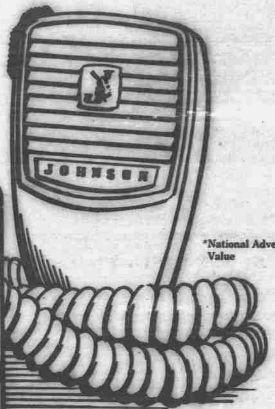
*National Advertised Value