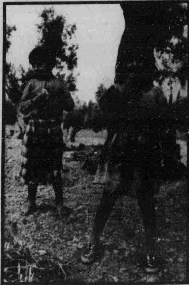
Gypsy Gypsy Girls Near Megara, Greece 1969