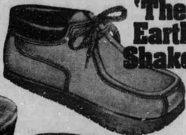
'The Earth Shaker'