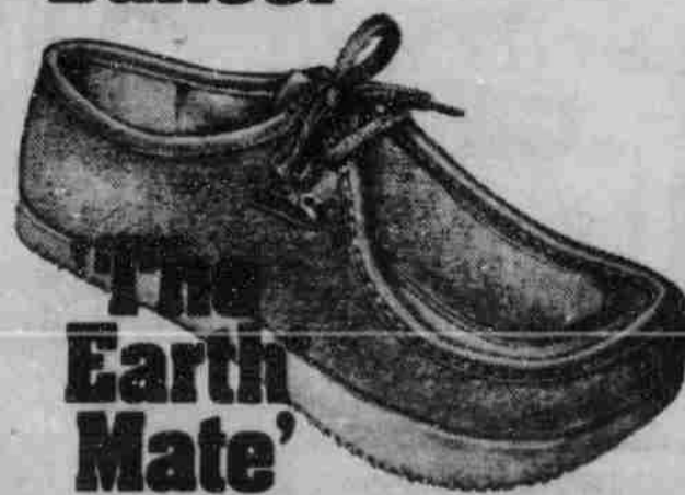
'The Earth Mate'