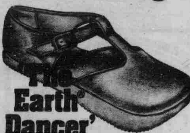
'The Earth Dancer'