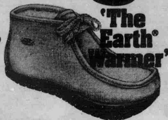
'The Earth Warmer'