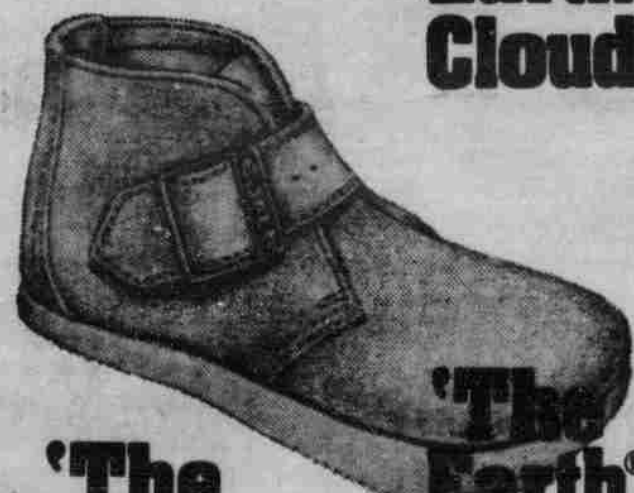
'The Earth Buckler'