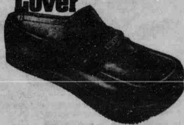
'The Earth Lover'