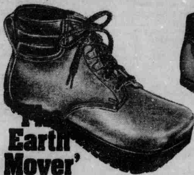
'The Earth Mover'