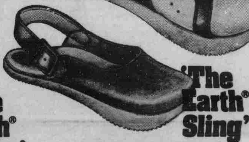
'The Earth Sling'