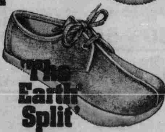
'The Earth Split'