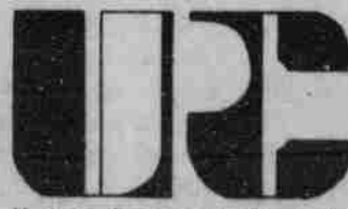
Union Program Council

Interviews will be held for the following positions: three members-at-large (who will become the UPC officers); secretary; chairpeople for Art Lending Library, Black Activities, Coffeeshouse, Concerts, Contemporary Arts, Foreign Film Series, Hostessing, Human Potentials, Jazz & Javs, Model United Nations, Record Lending Library, Talks & Topics, Visual Arts, Walpurgisnacht.