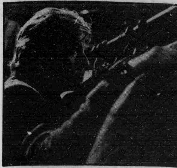
Robert Redford stars as a CIA man in Three Days of the Condor.