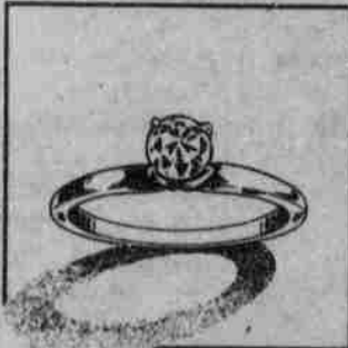
Diamond solitaire, 14 karat gold, $695