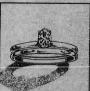
Oval shaped diamond bridal set, 14 karat gold, $425