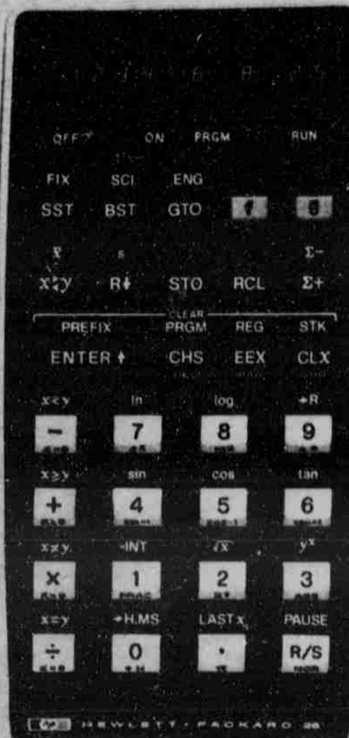
The Hewlett-Packard HP-25 Scientific Programmable $195.00*