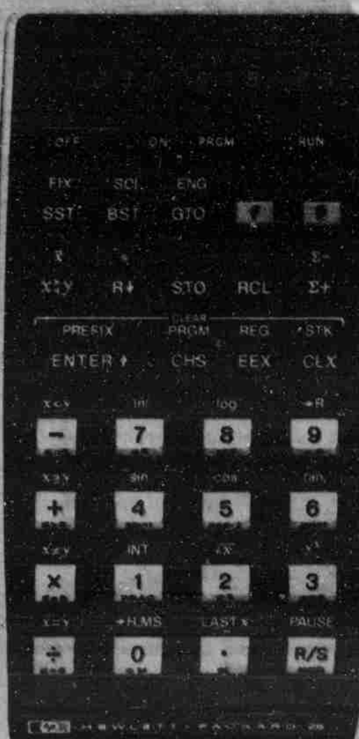
The Hewlett-Packard HP-25 Scientific Programmable $195.00*