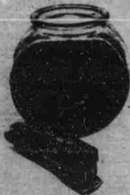
Clue: Staples in bowl could be loaded into 500 to 500 Tot Staplers.