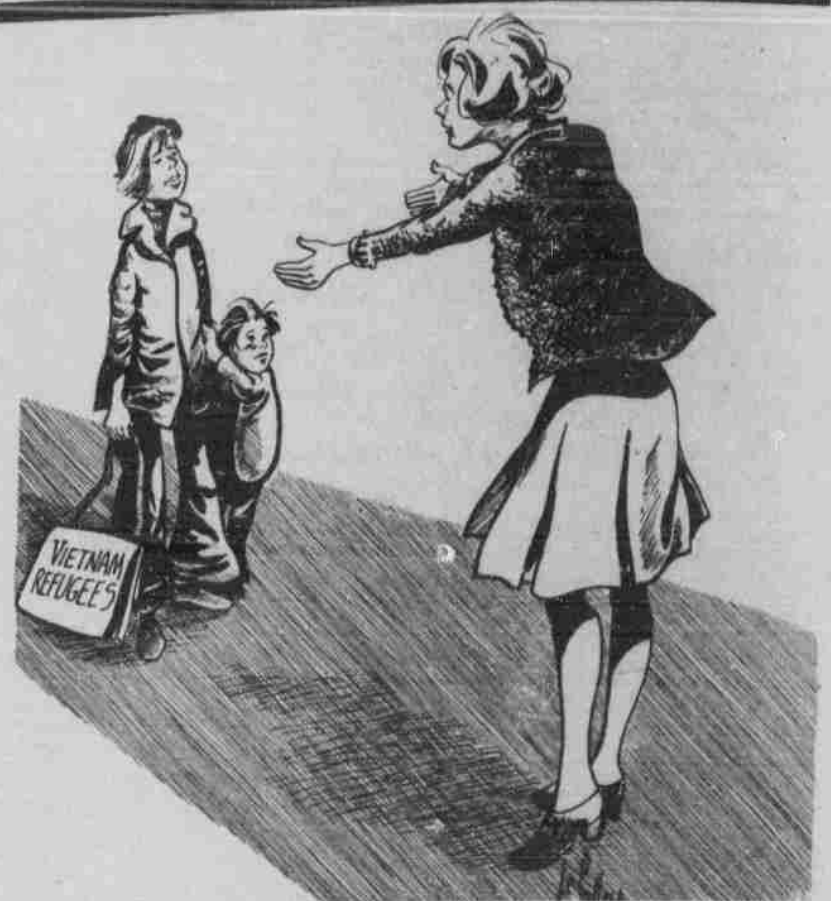
More American arms.