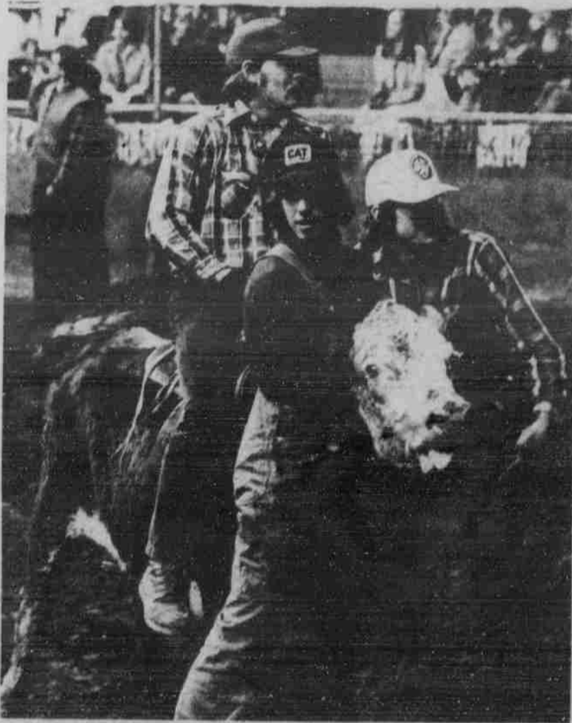
Three "cowboys" prepare to ride their "wild bull" during this weekend's rodeo at the State Fairgrounds.

Following the Curtis rodeo, four remain before the national finals in Bosman, Mont. in mid-June.