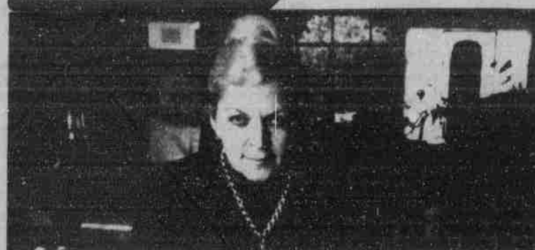
Film-makers' Showcase THE FILMS OF STORM DE HIRSCH

HUDSON RIVER DIARY BOOK I: CAYUGA RUN (18 minutes) BOOK III: WINTERGARDEN (5 minutes) BOOK IV: RIVER-GHOST (9 minutes) THE COLOR OF RITUAL THE COLOR OF THOUGHT 1—DIVINATIONS 2—SHAMAN: A TAPESTRY FOR SORCERERS 3—PEYOTE QUEEN