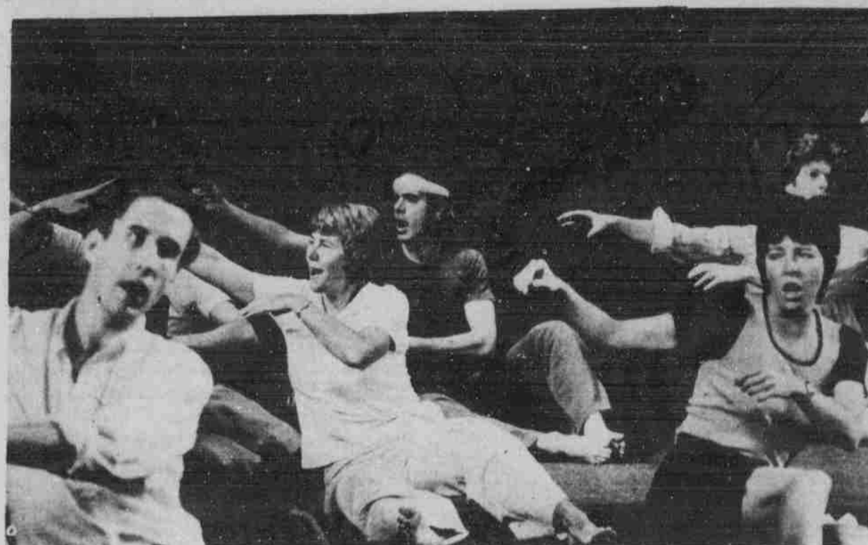
Members of New York's City Center Acting Company practice breathing and voice exercises.