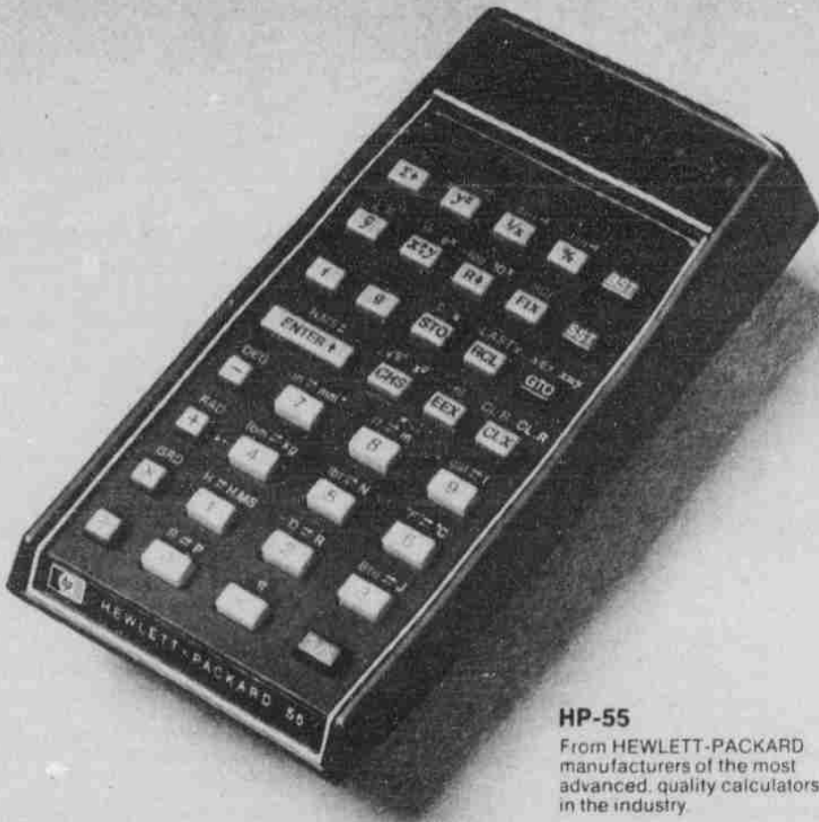
HP-55 From HEWLETT-PACKARD manufacturers of the most advanced, quality calculators in the industry.

No waiting for delivery. Your University Calculator Center has the largest inventory of quality units available anywhere. Plus, we specialize in the calculator requirements of the college student.