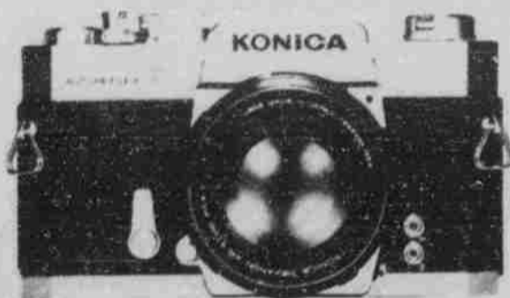
More than 100 Systems Components make T3 the World's Most Advanced Automatic SLR.

KONICA The world's most experienced automatic cameras