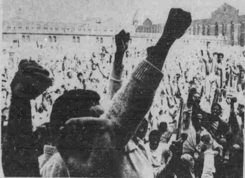
Rebellious inmates in the documentary film, Attica, which will be shown this week at Sheldon.