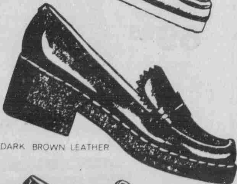
DARK BROWN LEATHER