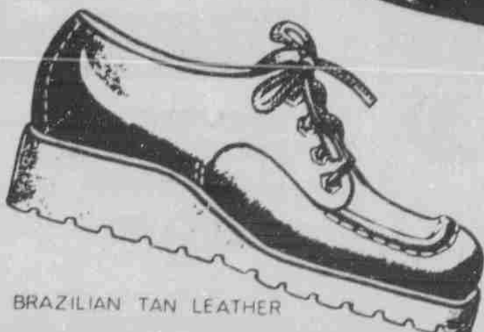
BRAZILIAN TAN LEATHER