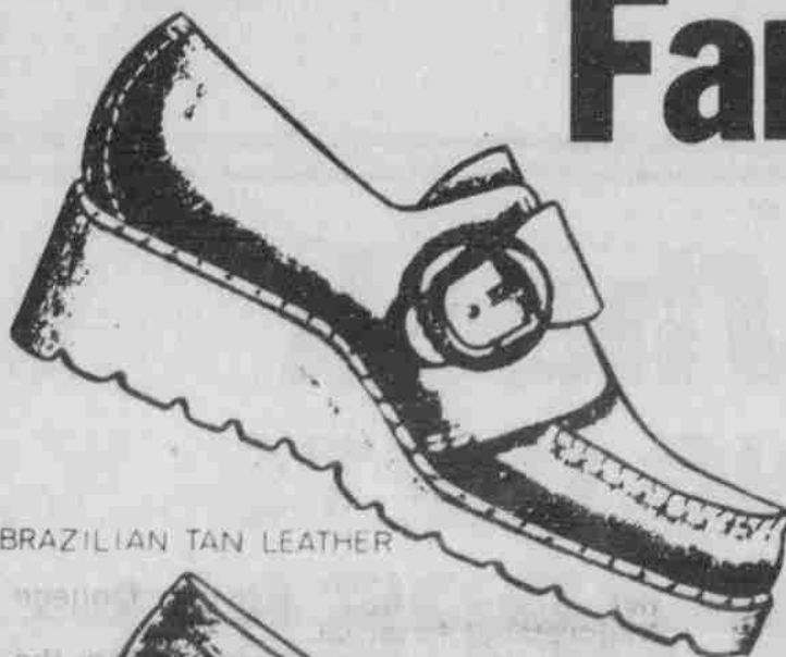
BRAZILIAN TAN LEATHER