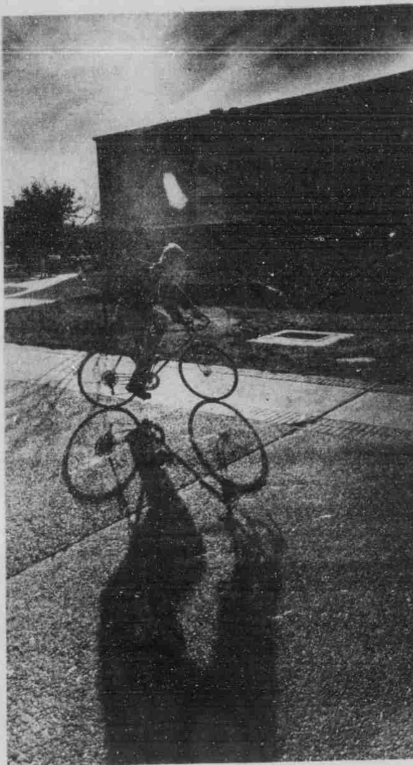
Lone cyclist pedaling home on a fall afternoon.