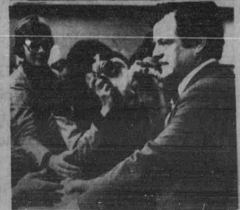
Sen. George McGovern, President Gerald Ford and Sen. Edward Kennedy—they are only three of the names suggested by UNL students surveyed for Superpoll '74 as being the most prominent people in national politics. Students also suggested the three as 1976 presidential candidates.