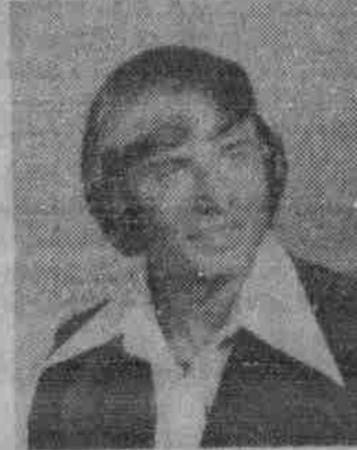
Professional Color Portraits.