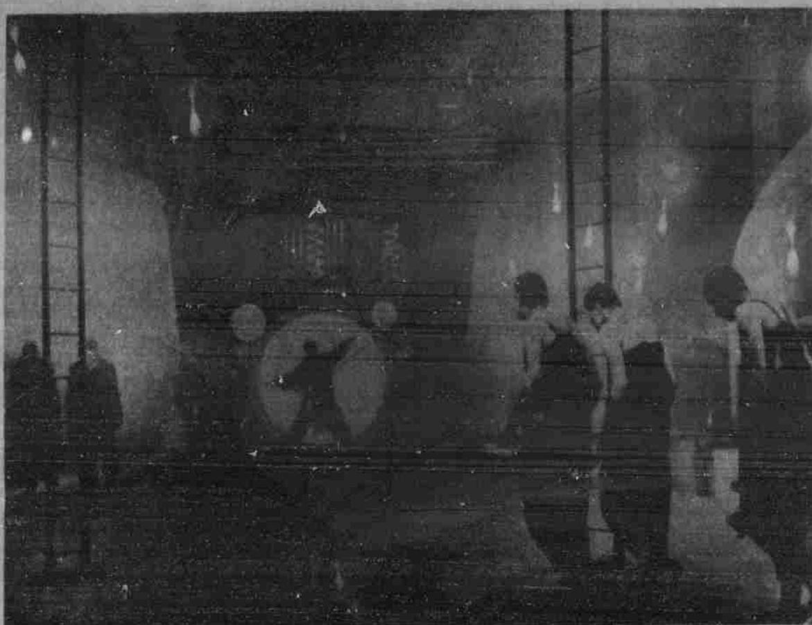
Forced laborers slave over the huge machines in the underground caverns of Fritz Lang's "Metropolis", this weekend's Horror/Fantasy film at Sheldon.

NOW! AT THE STUART (ENDS TUES) SHOWS AT 1:30-3:30-5:30-7:30-9:30