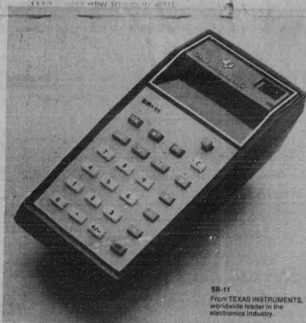
SR-11 From TEXAS INSTRUMENTS, worldwide leader in the electronics industry.

No waiting for delivery. Your University Calculator Center has the largest inventory of quality units available anywhere. Plus, we specialize in the calculator requirements of the college student.