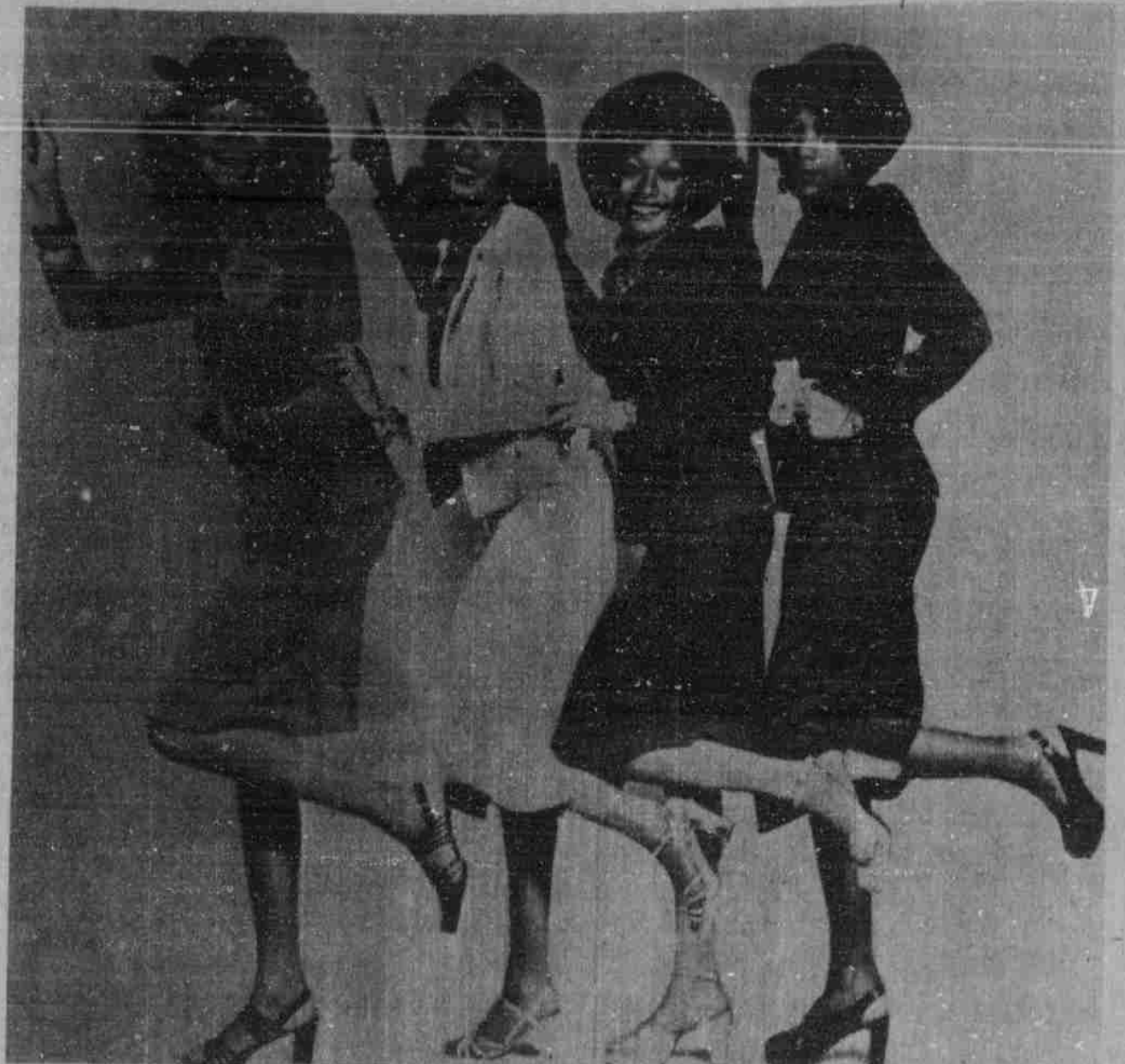
The Pointer Sisters appear in concert on the ETV Network on Aug. 14.