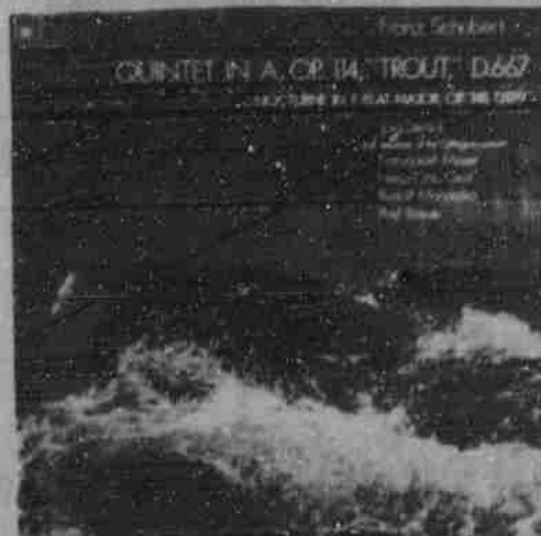
SELECTIONS PERFORMED ON ORIGINAL INSTRUMENTS