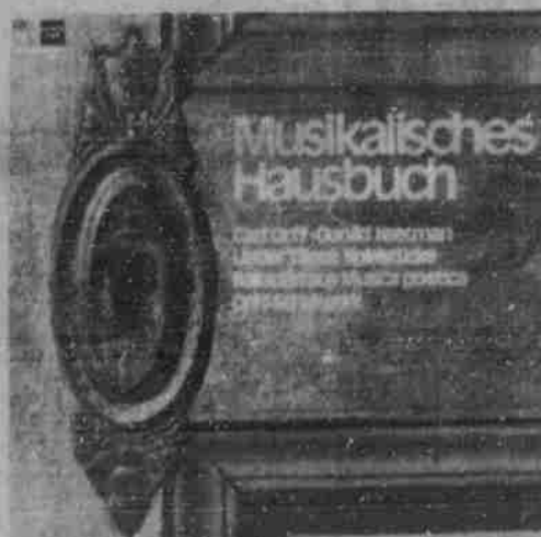
EUROPEAN CLASSICAL RECORDINGS

FEATURING, FROM THE RAINBOW OF BEAUTIFUL SOUNDS FROM BASF: