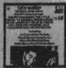
Fats Waller Collection J18