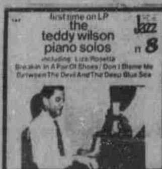
Teddy Wilson Piano Solos J8