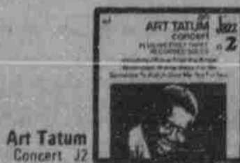
Art Tatum Concert J2