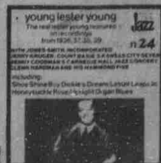
Lester Young Young Lester Young J24