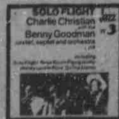
Charlie Christian Solo Flight, Vol. II J3