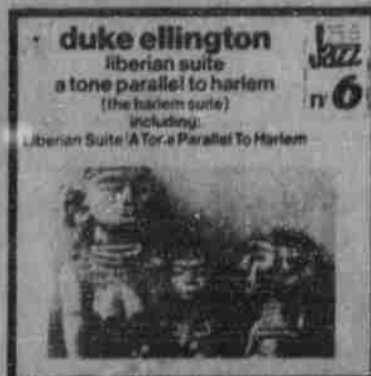
Duke Ellington Liberian Suite/Harlem Suite J6 Also: Priming for the Prom J11 Monologues J20 The Complete Duke Ellington, Vol. I 2J29 (2 Discs)