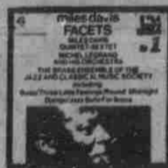
Miles Davis Facets J1 Also: Miles at Newport J17