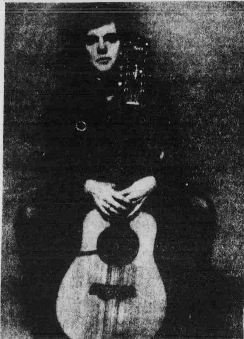
Leo Kottke, legendary guitarist, will appear in concert Friday at 8 p.m. in the Nebraska Union Ballroom. The concert is sponsored by the Union Concerts Committee and admission is $2.

It's difficult to describe the music Oldfield has created here because of its diversity, but as far as listening goes, that may be the album's tour de force. Everyone who listens cannot help finding something they like.