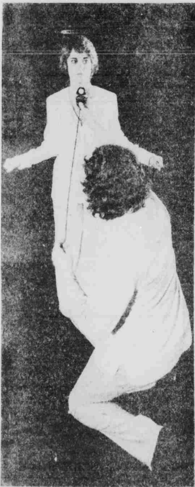
Clothes by Quentin's

Fitted cardigan sweaters, argyle and art-deco patterned pullovers and traditional shetlands with a