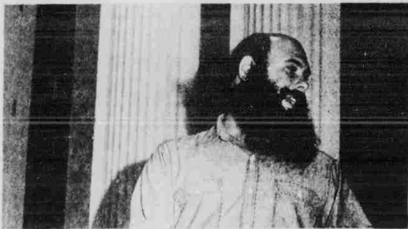
Author Andrew Weil

Approval of the 1974-75 operating budget request of the University is the principal item on the agenda. Regents had postponed approval pending completion of an analysis of student credit hours generated by enrolments this fall on the three campuses.