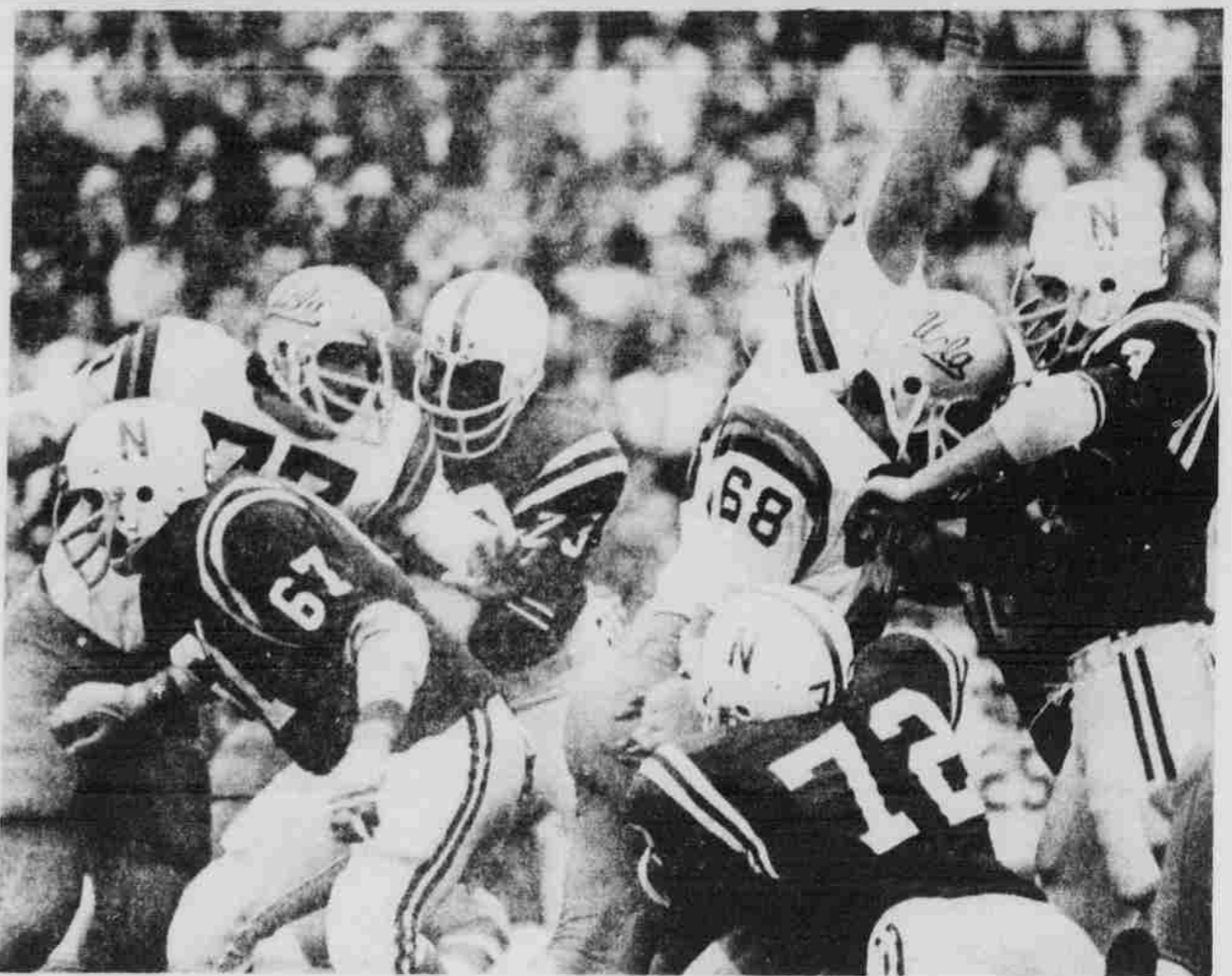
Nebraska returns to action Saturday as the Huskers battle the North Carolina State Wolfpack from Raleigh, N.C.

Saturday's Husker opponent, North Carolina State, picked up its second straight win with a 43-23 victory over Virginia.