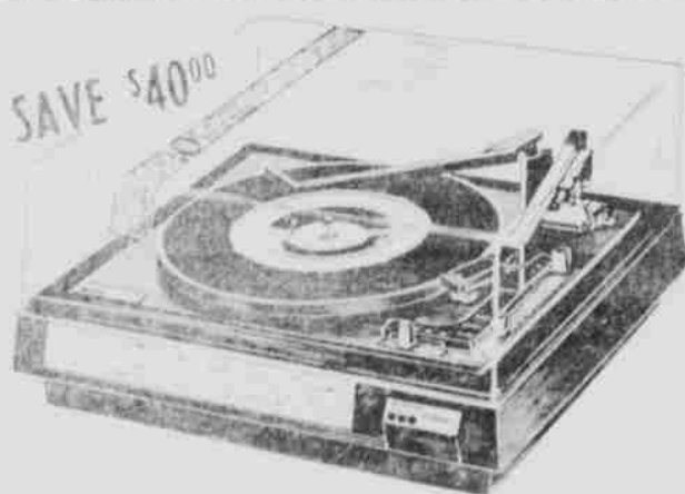
BSR 310 Turntable