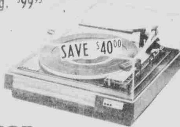
BSR 510A/X Turntable

INCLUDES TURNTABLE, SHURE CARTRIDGE, BASE and DUST COVER