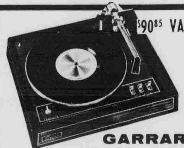
GARRARD 42M Turntable

42M GARRARD TURNTABLE Plus CARTRIDGE AND BASE . . . . . $90.85 WORLD'S GREAT PRICE . . . . . $54.50