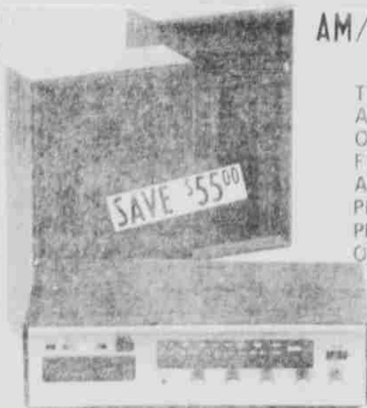
AM/FM Stereo 8 Track Player

TWO SPEAKER SYSTEM. SOLID STATE AM-FM-FM MPX STEREO TUNER. BLACK-OUT DIAL WITH TINTED GLASS. FIVE ROTARY CONTROLS. BUILT-IN AM/FM/FM ANTENNA. AUTOMATIC PROGRAM SELECTOR. STEREO HEADPHONE JACK. AC CONVENIENCE OUTLET. PHONE INPUTS & SPEAKER OUTPUTS. WALNUT FINISH.