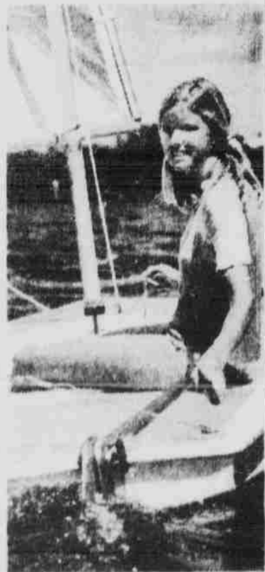
The internal protection more women trust

So don't change your summer plans just because your period might interfere. Tampax tampons let you sail, swim, water-ski, sunbathe—just like any other day of the month.