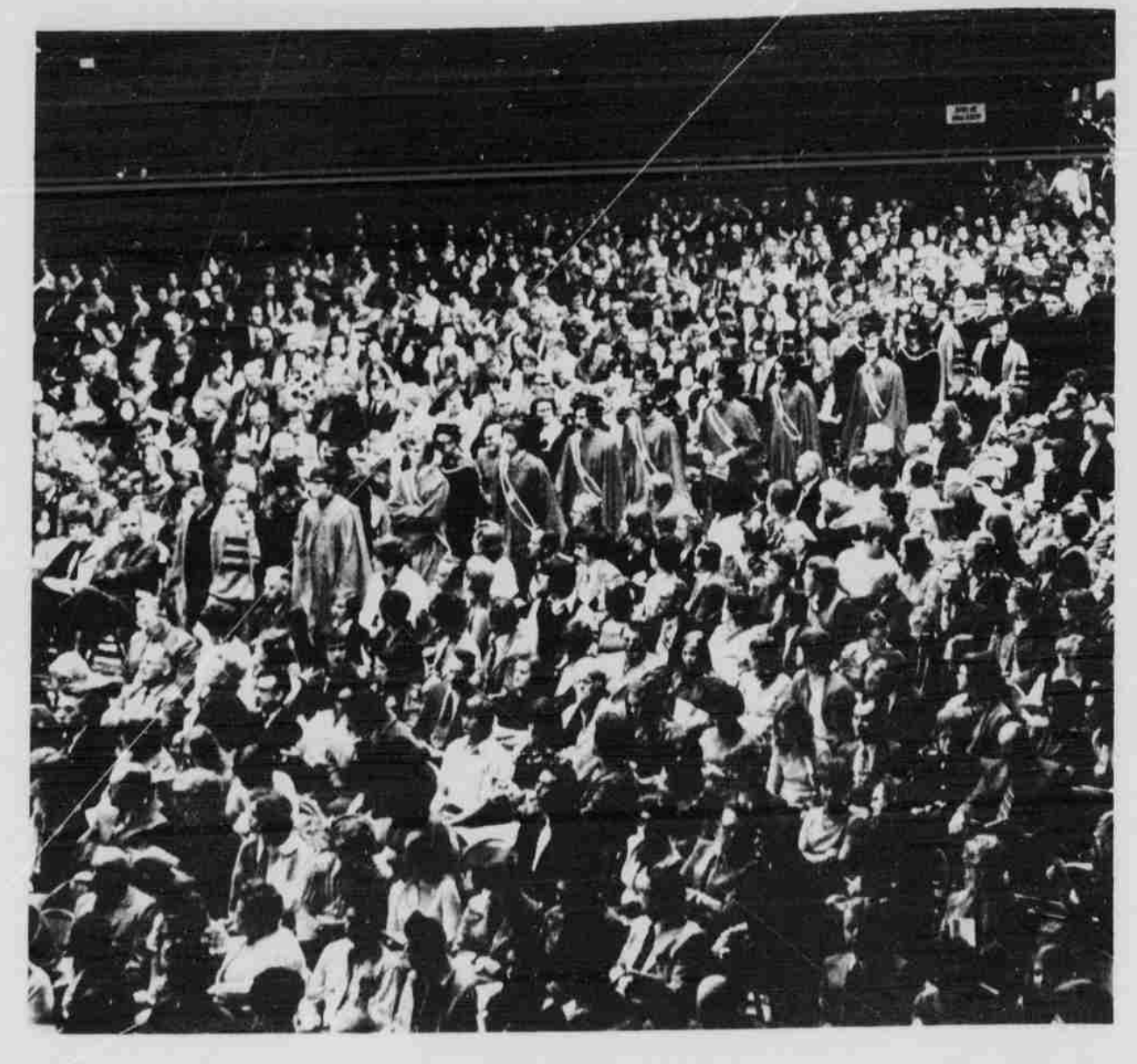
Honors Convocation . . . parents and students assemble to recognize UNL achievers.

Superior scholarship awards went to 263 seniors who ranked in the upper three per cent of their college or who have been on the honors list since their freshman year. A number of students in all classes were recognized for high scholarship.