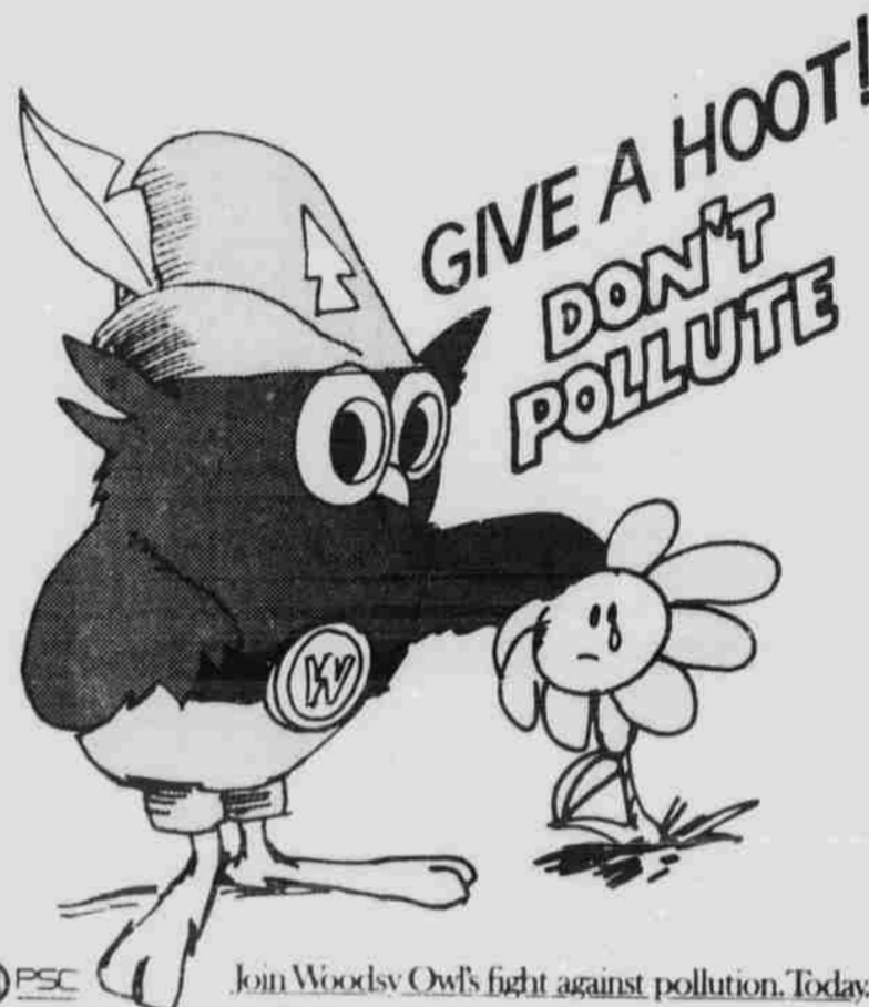
Join Woodsv Owl's fight against pollution. Today.

After baccalaureate degree requirements and summer training periods are completed, students are commissioned officers in the Navy or Marine Corps.