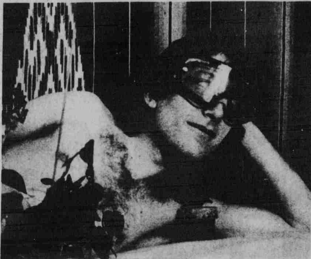
Willie Wonka . . . SLPP second vice presidential candidate.

Address: The Daily Nebraskan/34 Nebraska Union/14th & R Streets/Lincoln, Nebr. 68508. Telephone: 402/472/2588.