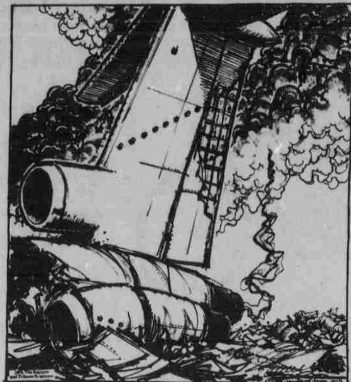
Israeli version of "peace with honor"

Yet Israel's military chief of staff still maintains that the decision to shoot the airliner out of the sky was a correct decision. And Israeli Prime Minister Golda Meir says the incident would not have happened if "we had an inkling that there were passengers on the plane." It seems reasonable to expect that