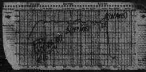
This is what EPI's Linear Sound looks like.

CURVE "B" Now look at curve "B", and you'll see something even more remarkable: another virtually straight line. What's remarkable about this is that curve "B"