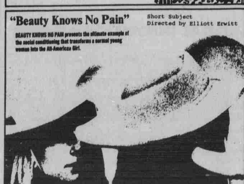
wednesday, february 7, 1973