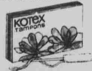
Femininity today from Kimberly-Clark

Allow 4 weeks for delivery. Offer expires December 31, 1973. Limit one per customer.