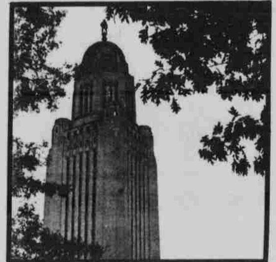
Legislature from Lancaster County (4-year term, nonpartisan)