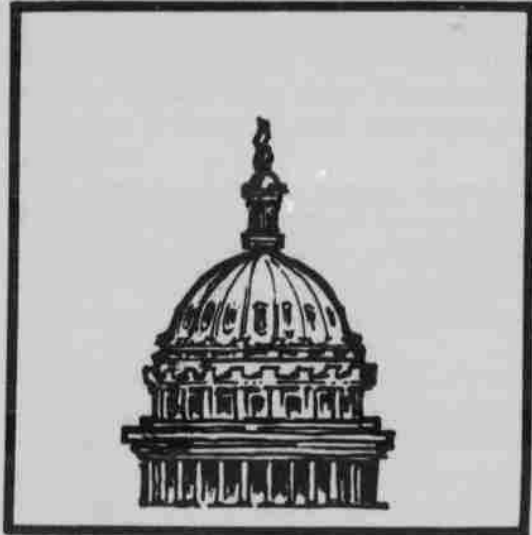
U.S. Senate (6-year term)

Because of space limitations, Friday can provide short biographies only on candidates for the U.S. Senate, U.S. House of Representatives, Board of Regents, Legislature in Lancaster County, and Lancaster County Board of Commissioners. Biographies include age, residence, past political involvements, education and occupation.