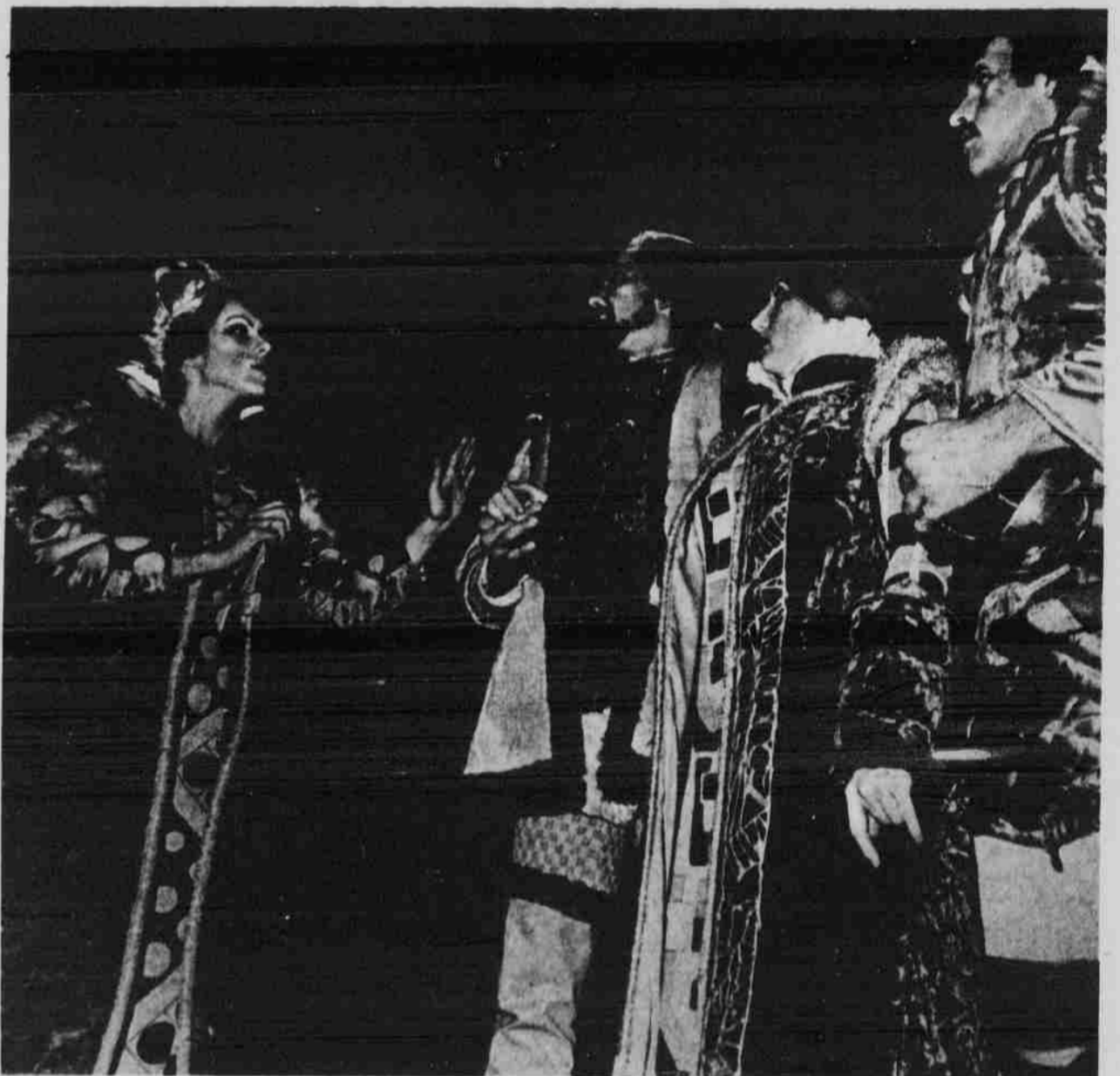
Don Giovanni woos his latest subject at Kimball Recital Hall today through Sunday at 8 p.m.