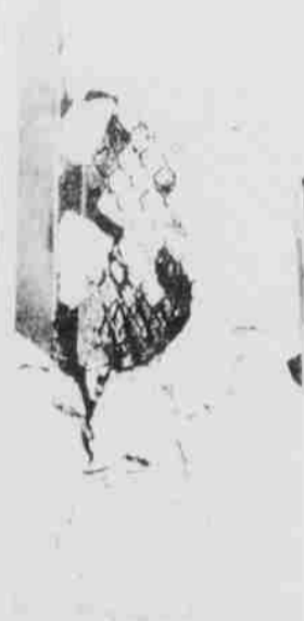
Cracking plaster is common, as here in a Burr utility room.