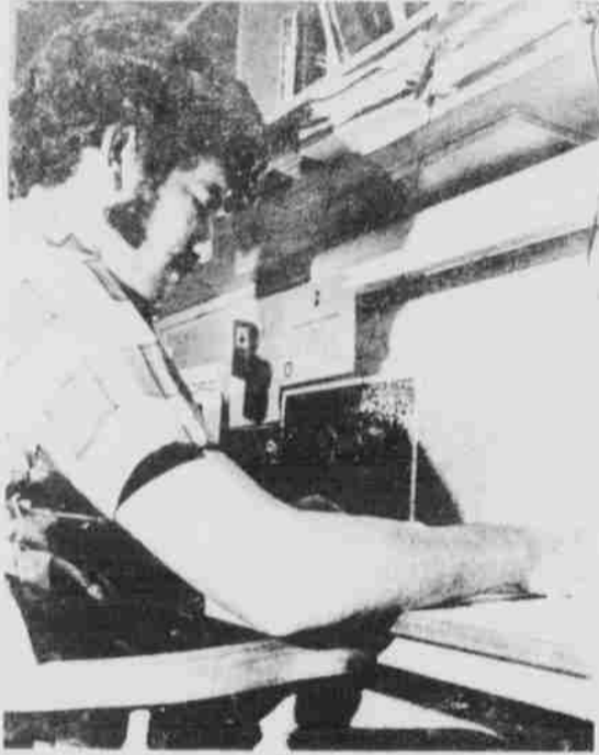
The chairs that are supposed to go with desks in the dorms don't fit under the desks. Students have to lean forward a little to study. At least one student has sawed off the legs to get his chair to fit.