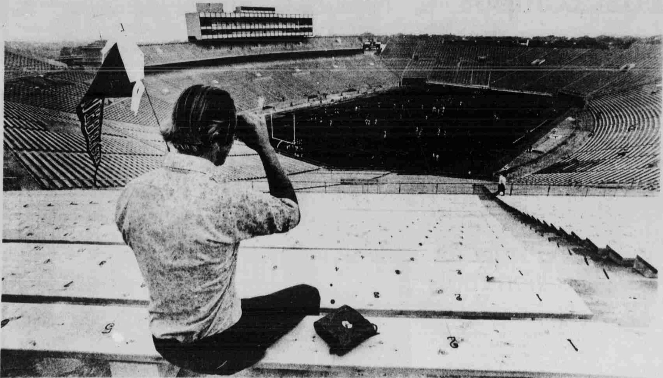
A view . . . from the top—construction on the 9,000-seat addition to Memorial Stadium is scheduled to be finished in time for Nebraska's first home game September 16.