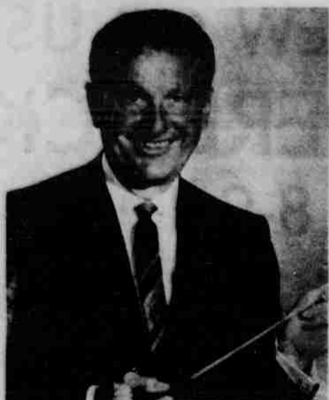
Worst press release photo of the year... "and a one and a two..."