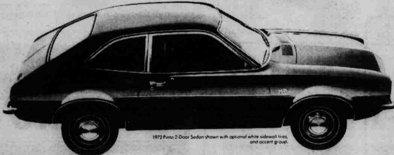
1972 Pinto 2-Door Sedan shown with optional white sidewall tires, and accent group.

When people shop for a small car, they look for some very simple basic values. Dependability. Economy of money and style. Good mileage and long life.