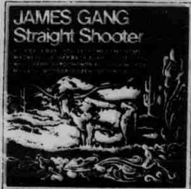
A B C 741