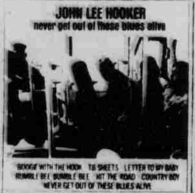
A B C 736