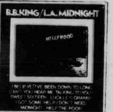
A B C 743