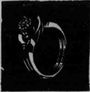
TRIPOLI $325 WEDDING RING $2.50

FOR THE YOUNG BUDGET Beautiful styles! Brilliant diamonds! Budget prices! Easy credit, of course.