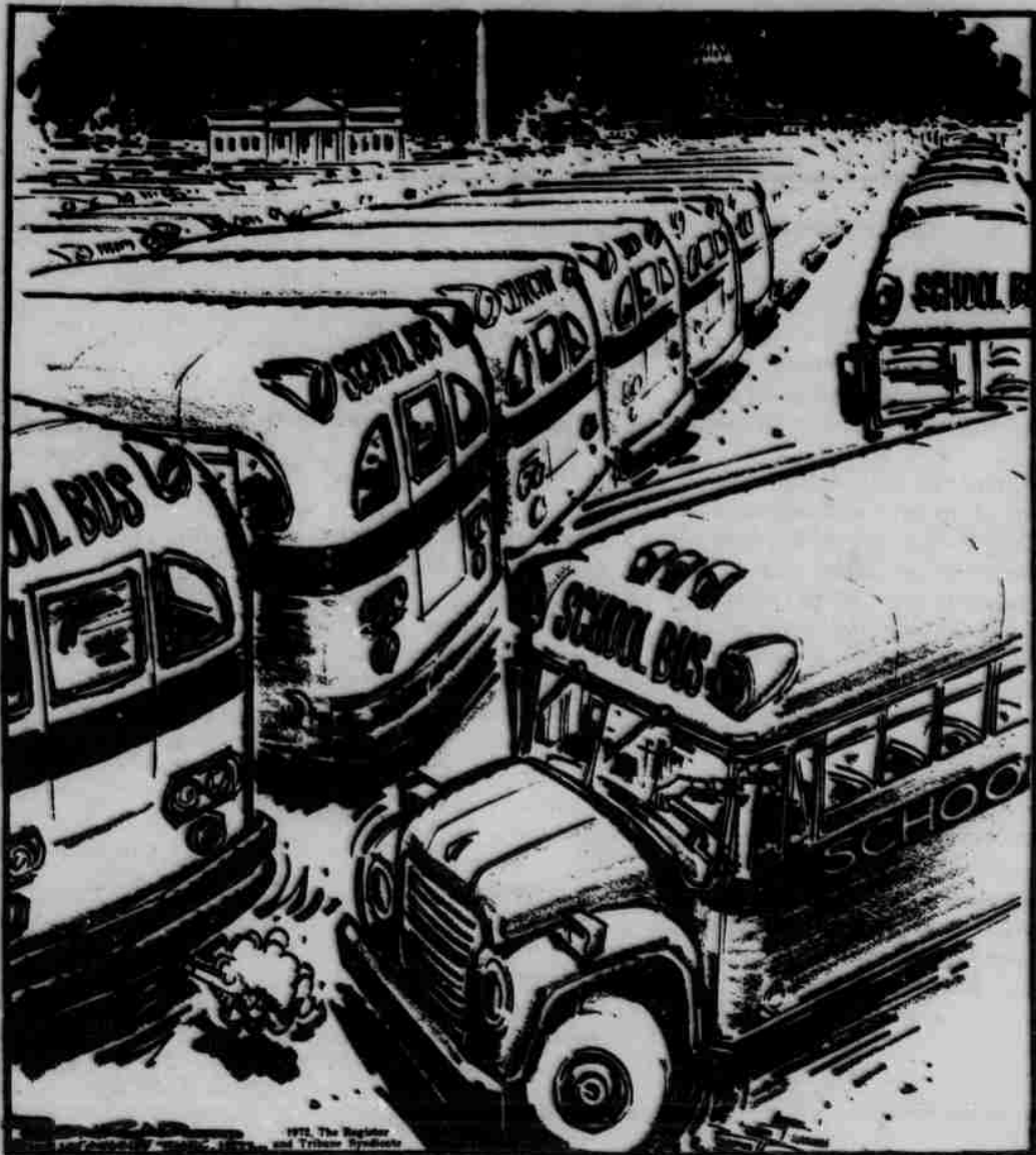
The largest recall in automotive history.