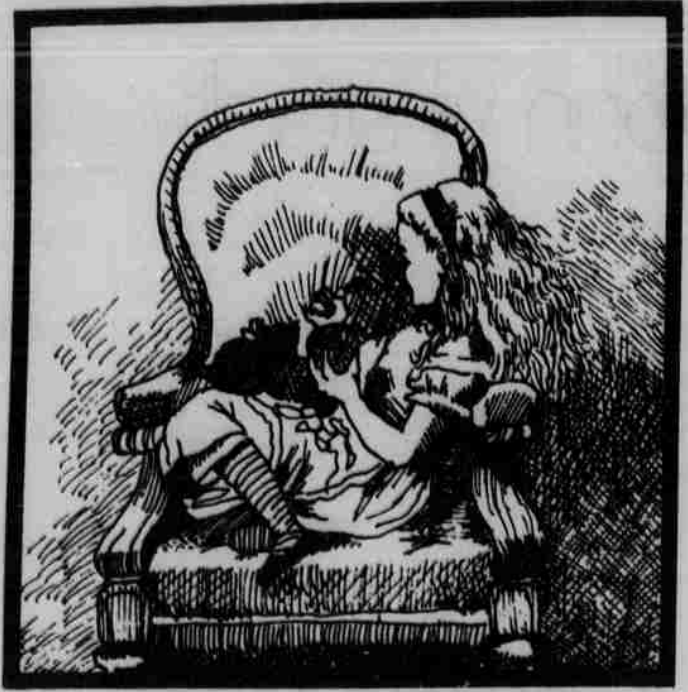
"Alice In Wonderland". . . Lewis Carroll's satire provides the theme for the 1972 Cornhusker , which will return to hardbound format after two-years in paperback form.