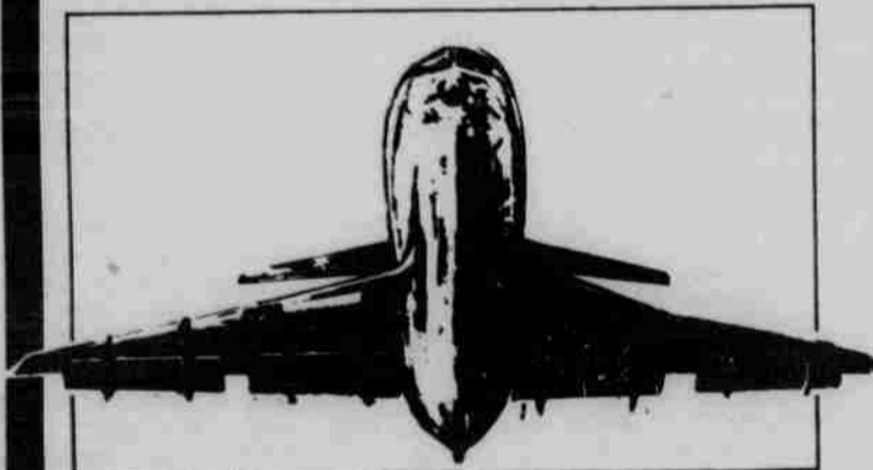
Round trip Party Jet transportation with complete in-flight service.